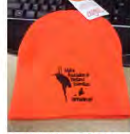
Knit Hat: $12.50