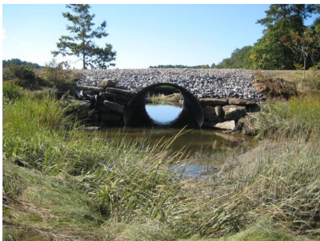
Thomas Bay Salt Marsh Restoration, Adams Road inlet, post-construction, 9-2-2011.

Visit http://www.cascobayestuary.org/wp-content/uploads/2014/08/2012_cbep_thomas_bay_marsh_restoration.pdf for more information on the Thomas Bay Salt Marsh Restoration.