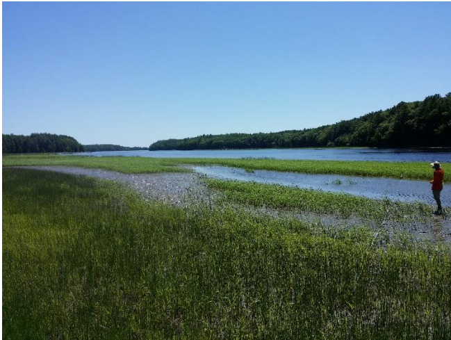
Here, Jack and his undergraduate field assistant, Braden Adams, are laying out a transect at low tide.

Jack’s research takes place in the tidal freshwater wetlands surrounding Swan Island in Merrymeeting Bay. Jack will be presenting about his work on the effect of increased duration on benthic communities in tidal freshwater wetlands. He used his stipend, in part, to purchase materials necessary to construct invertebrate pitfall traps and preserve the resulting specimens.