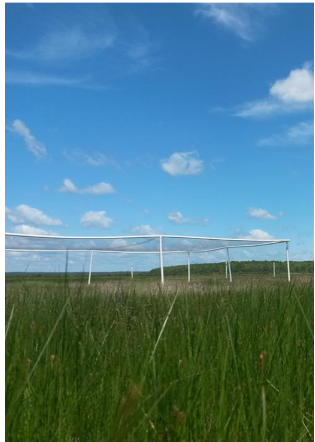
Exclosure experiments allow researchers to simulate the impact of losing tidal-marsh specialist birds on local food webs by “excluding” birds from the study area. Pictured is an avian exclosure in a Southern Maine marsh.