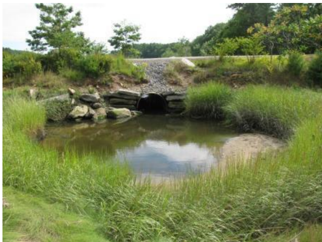
Thomas Bay Salt Marsh Restoration, Adams Road inlet, pre-construction, 8-9-2011.

Conference and Annual Meeting this year! The Meeting is scheduled for Thursday, March 23, 2017, at Thorne Hall, Bowdoin College, in Brunswick, Maine.