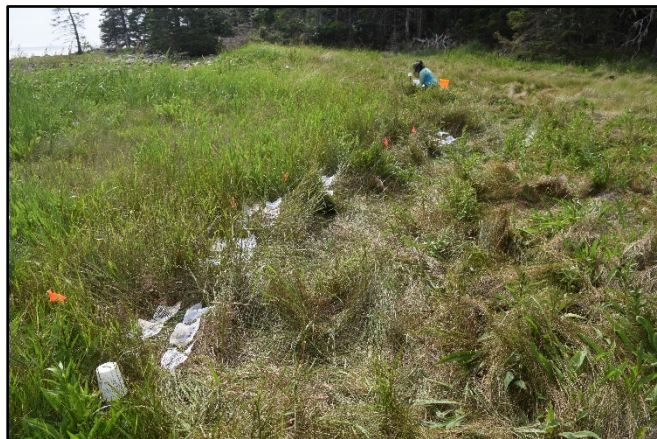
Hannah Mittelstaedt's salt marsh study site.